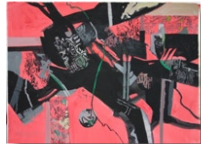
"That Old Black Magic"