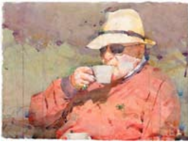
“Cosi Comincia Il Giorn”