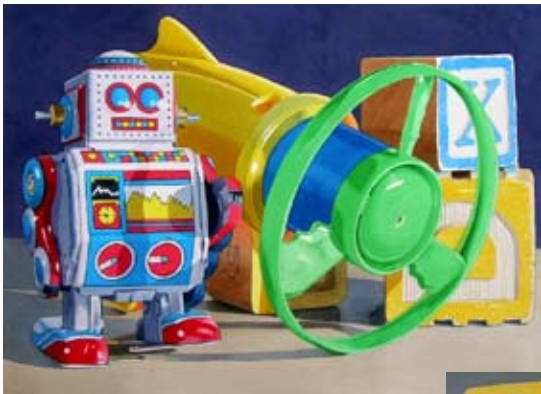
"WHEN ROBOTS ATTACK"

to major in engineering, in the long run, art won out and he graduated from Penn State with a triple major in Graphic Design, Photography and Painting. After graduation he worked as an Art Director at a television Studio for five years before making the decision to paint full time.