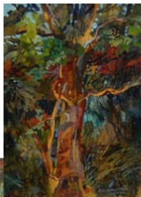
"TREE OF DARBY"

the age of eight. She received her B.A. in art from Radford University, and her M.A. in art history from the University of