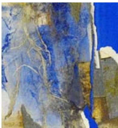
paintings by Pat Dews

Pat's workshops are exciting, very intense and cover much ground. She strongly encourages workshop students to attend the general meeting demo. The head start will help them at the workshop.