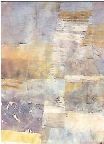
Ways of Klee 39 x 29

color pigments are poured through porous filters such as rice papers, laces and facial tissues, the water's action lends a fine sophistication to the painted array on the watercolor paper. One's own sense of play, color, good sense, good design, and textures are then called to work on these chance effects to make the developing painting an individual work. Fifteen poured starts can yield fifteen fresh points of view, whether landscapes, quilts, or abstractions.